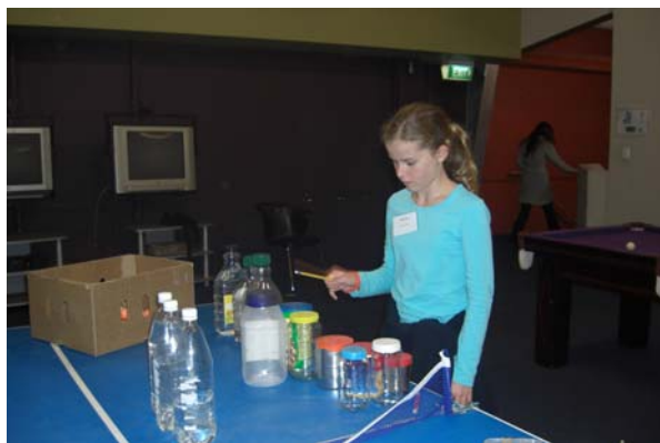
Experimenting with sound