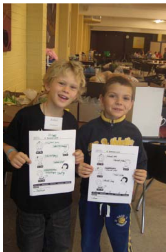
Happy Indonesian Pupils