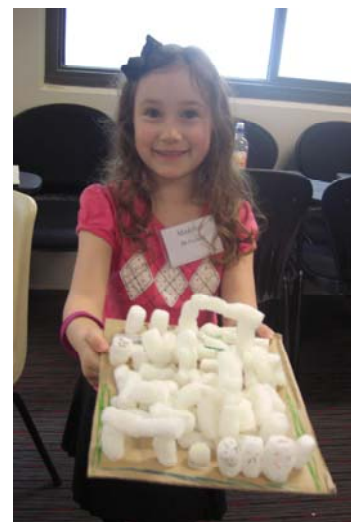
I built my house on the rock