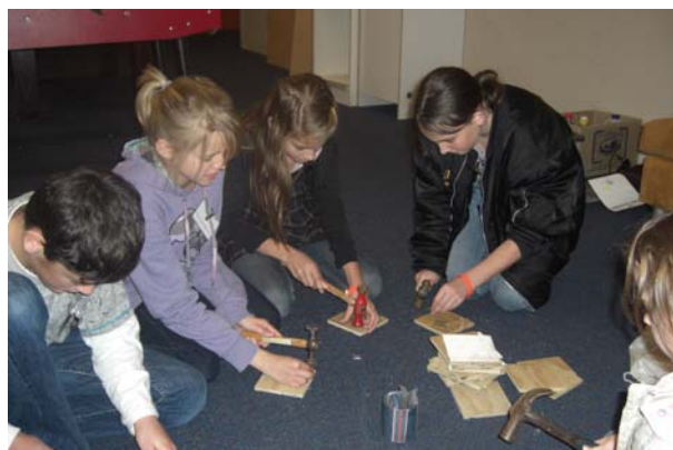
Making musical instruments in Science